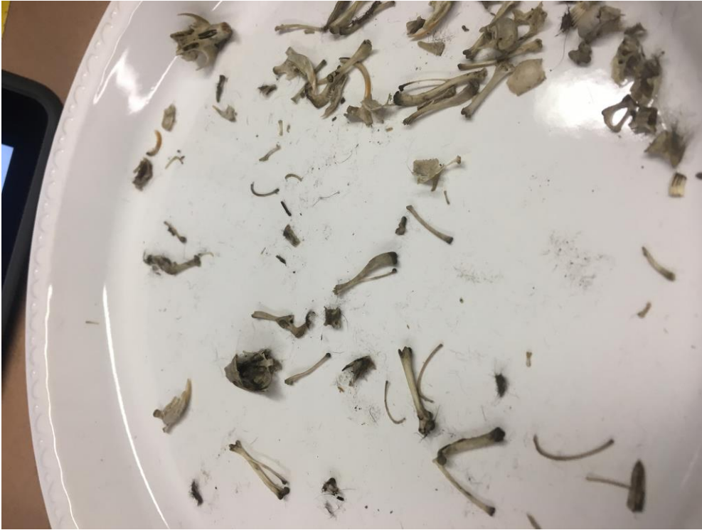
Caption for Photo 1: The undigested bones of the owl's meal.